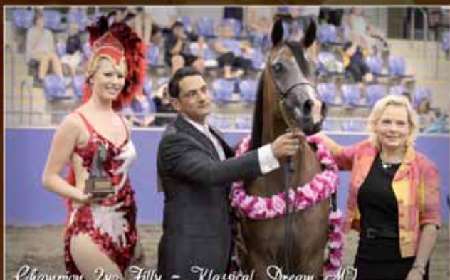
Champion 2yo Filly - Klassical Dream MD Klass x Mustangs Magnum Owned by Mulawa Arabian Stud