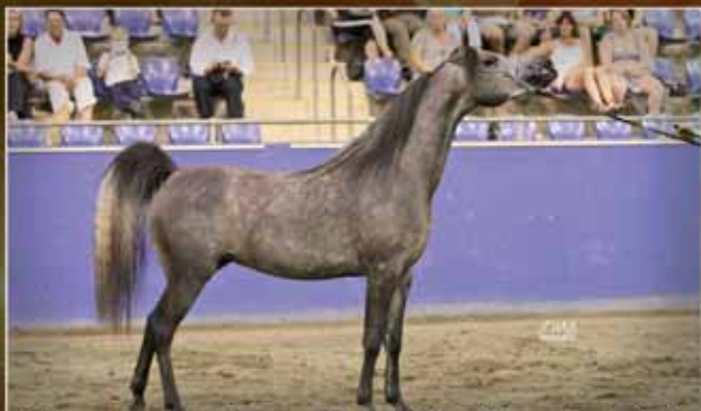
Champion 3-4yo Filly - Quartz Hill Farm Ooh LaLa Om El Eminence (imp USA) x Quartz Hill Farm Puss in Boots Owned by Quartz Hill Farm

Magnum Physce x Karmaa Owned by Mulawa Arabian Stud