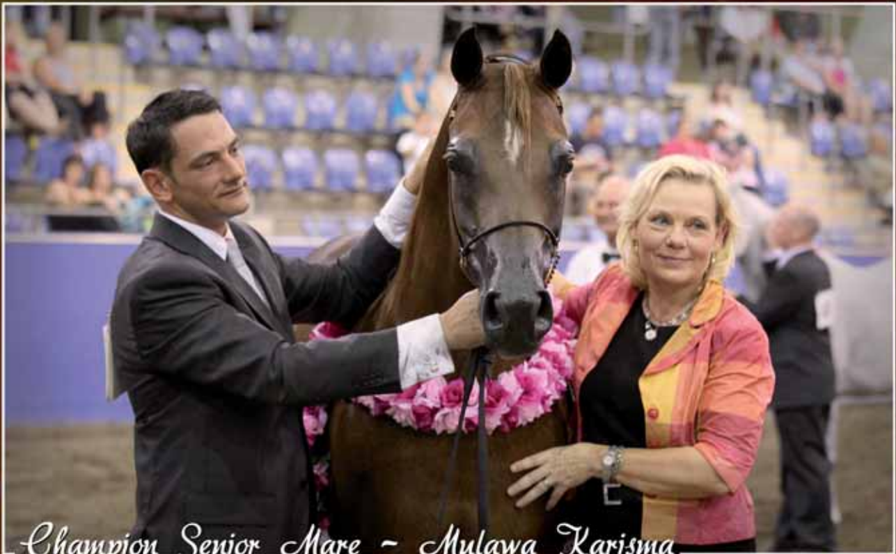
Champion Senior Mare - Mulawa Karisma

Magnum Physce x Karmaa Owned by Mulawa Arabian Stud